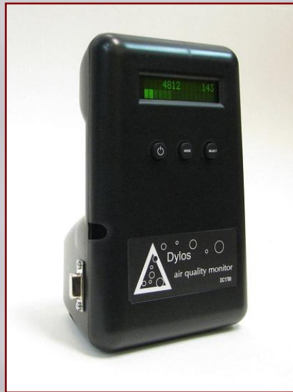
Dylos DC 1700