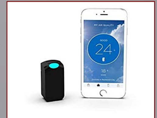
Wynd Personal Air Quality Tracker